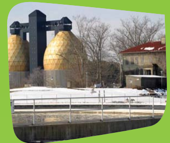
Back River Wastewater Treatment Plant in Baltimore, MD

Wind power also can be used to charge batteries for buildings not connected to the utility grid, or to supply some or all of the electricity for businesses, schools, colleges, prisons, or military bases. In general, the technology provides the best return on investment in areas with high utility electricity prices and a strong, consistent wind resource.