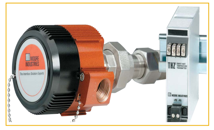
Figure 1 . If an instrument can meet most international safety requirements it can probably pass ATEX certification tests. The THZ<sup>2</sup> and TDZ<sup>2</sup> family of HART Temperature and Signal Transmitters from Moore Industries have Factory Mutual (FM), ATEX, cFMus (US/Canada), IECEx, CSA, CENELEC/ATEX 94/9/EC Directive and ANZEx (Australia and New Zealand) approvals for intrinsically-safe, non-incendive, explosion-proof and flame-proof operations in Class 1, Division 1, Groups A, B, C and D.

many protection techniques commonly used to annihilate, purge or drastically minimize the risks of explosion are Intrinsic Safety and Flame/Explosion-Proof apparatus, which are highly common in the process instrumentation industry. Such methods must be embedded in the initial engineering design and subsequent testing of electronic devices, and maintained through installation and commissioning.